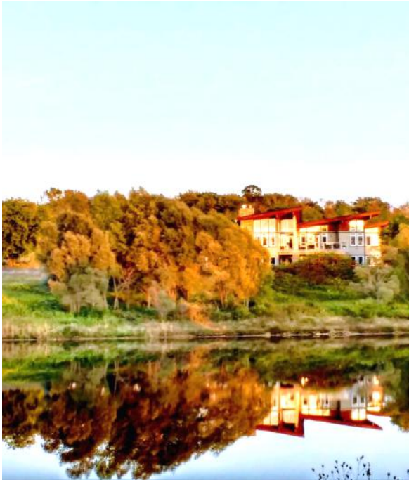
2018 Camp Location, Newcastle ON